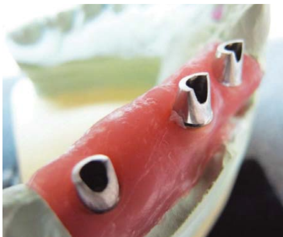
Figure 6: Custom implant abutments can offer ideal retention and emergence profile formation.

The abutment of a dental implant can also affect the soft tissue formation and the emergence profile. 34 Various abutments are available for dental implants, ranging from stock abutments, stock-esthetic abutments, custom-cast abutments, and custom-milled abutments (Figure 6). Custom abutments offer the best strategy for the formation of an ideal emergence profile and soft tissue health around a dental implant. 35 Once an accurate impression is taken of a dental implant the dental laboratory can create a custom abutment from a soft-tissue model. A milled titanium abutment offers the advantage of being solid metal with no porosity and increased strength versus a cast metal abutment. Milled zirconia abutments offer ideal esthetics due to their light color, but they are not as strong as a metal abutment. 36