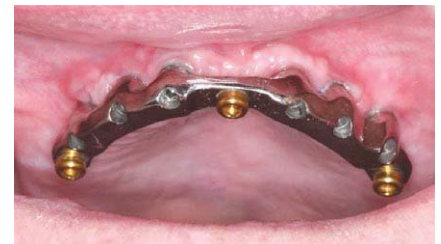
Fig 2a: Support for a bar over denture

Once alternatives have been presented, questions about their needs and preferences should be discussed. 5 A patient's lifestyle and occupation may help curtail a prosthetic choice. For instance, if a patient is missing all of his or her maxillary teeth, the options presented might be a denture, an implant supported bar overdenture, an implant-only supported overdenture, an implant-supported hybrid bridge, or an implant-supported cement or screw retained bridge (Figures 2a-c). A patient who travels often or is a public speaker may prefer a plan that involves fewer visits and a non-removable prosthesis with less palatal coverage. A woodwind musician or singer would probably prefer a fixed prosthetic rather than a removable prosthetic. Listening to a patient might also provide clues to his or her financial situation even if they do not tell you outright or perhaps they don't value esthetics as much