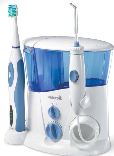
Figure 8: Waterpik® Complete Care combines the benefits of Water Flossing with superior sonic brushing in one unit.