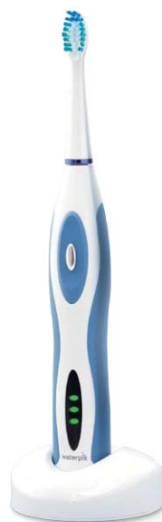
Figure 7: Waterpik® Sensonic® Professional Plus Toothbrush includes a standard, compact, and interdental brush head.

One preferred method to clean implants is a Water Flosser. A Water Flosser directs pulsating water to any area around the implant and prosthetic. It is easy to use and has been shown to be safe with implants (Figure 8). 50,51 Additionally, it will not scratch the implant or prosthetic replacement which is a concern with some interdental brushes. Some offices recommend rinsing with an antimicrobial such as essential oil or chlorhexidine. One study evaluated using a dilute solution of chlorhexidine (0.06%) in a Water Flosser and compared it to rinsing with 0.12% CHX. The Water Flosser group was more effective in reducing plaque and gingivitis and also had significantly less stain than the rinsing group. 50