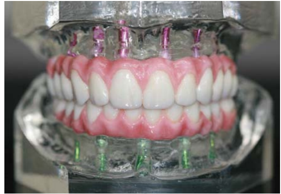
Figure 1: Example of a demonstration model for patient education.

Educating the patient may include demonstration models, diagrams, photos of previous cases, and/or animations of various final implant prosthetics (Figure 1). Computer-based education programs are available that clearly describe and show options for the patient. The available alternatives—non-implant options—should also be discussed. It is the dentist's role to educate patients so they can make an informed decision based on their personal needs and values.