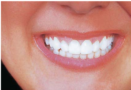
Figure 4: A high smile line that shows the junction between the tooth and gingival tissue.

Smile Line and Lip Support: Another step in assessing a patient is to document their smile line and examine their lip support. This is extremely important when treatment planning an edentulous maxillary arch. 17 The smile line and lip support required will help determine the type of prosthesis to be used. For instance, a patient who has worn a maxillary denture for many years may have lost bone along the maxillary ridge. When there is substantial bone loss in the maxillary anterior region, an implant-supported overdenture or hybrid type fixed bridge may be the only choice for the patient due to the lip support offered. 18 The gingival height and smile line are also important when one or more anterior teeth are to be replaced. Individuals with a high smile line often require bone and soft tissue grafting to provide a more exacting gingival margin (Figure 4). Photographs and measurements with a probe are recommended ways to document the esthetic criteria. This is a crucial step for dental implant success in the esthetic zone.