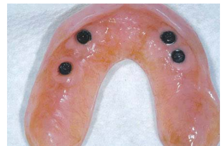
Fig 2b: Non splined over denture